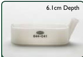
6.1cm Depth Ultra-Pro II™ style bracket 644-041 Replacement Kit 610-608