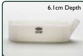
6.1cm Depth Ultra-Pro II™ style bracket 644-042 Replacement Kit 610-608

*Contact Hitachi for product ordering information at 800.800.3106